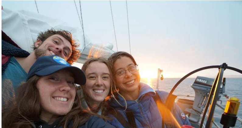
Crew SRV Marie Tharp with M/V Iceberg Dundee

The ice guard plastic pieces that are affixed to the APEX float with zip ties to best protect the integrity of the exposed sensors were reinforced in a manner that would remain clear of disrupting sensor performance. 66 grams of stainless steel (washers) were affixed to the bottom of the float with fishing line.